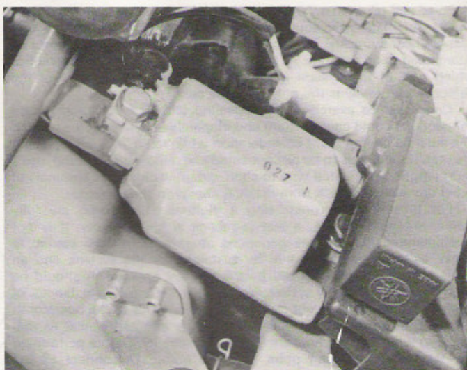
7.1 Ignition coil is bolted to frame below the fuel tank